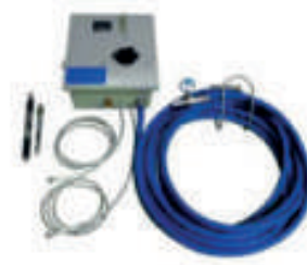
Double Inlet Foam Apparatus