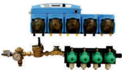
Washing Machine Liquid Dosing System