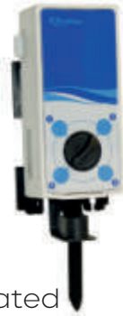
Concentrated Product Dilution Apparatus