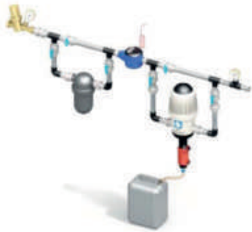
Equipment Application Diagram