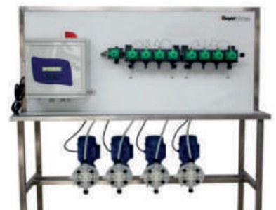
Washing machine Central liquid dosing system