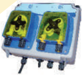
Dishwasher Detergent rinse aid pump