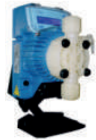
Digital Dishwasher Detergent Rinse Aid Pump with Prop