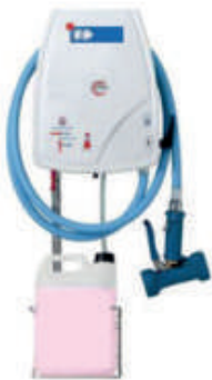
Spray Hose System