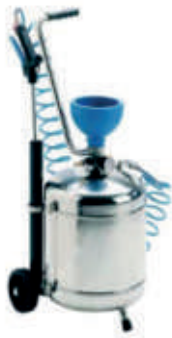
Mobile Foam Tank