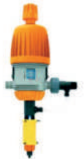
Single Inlet Dilution Equipment