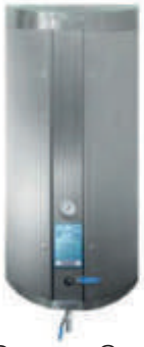
Main Pump Station