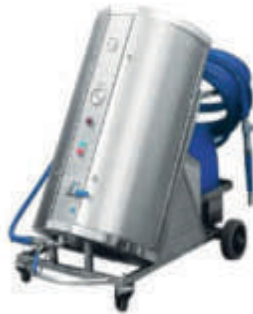
Mobile Pump and Satellite Unit