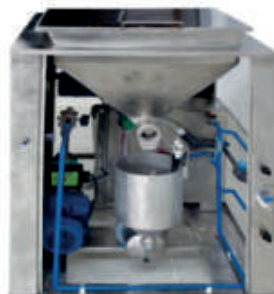
Washing Machine Central Powder Dosing System