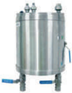
Dual Input Satellite Unit